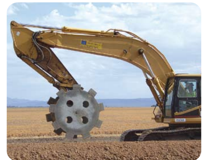
A Compacting Wheel packs the soil around the pipe in the trench

Construction is complete with 68 kilometres of steel pipe installed, providing water from Lake Bellfield to Supply Systems 1 and 2.