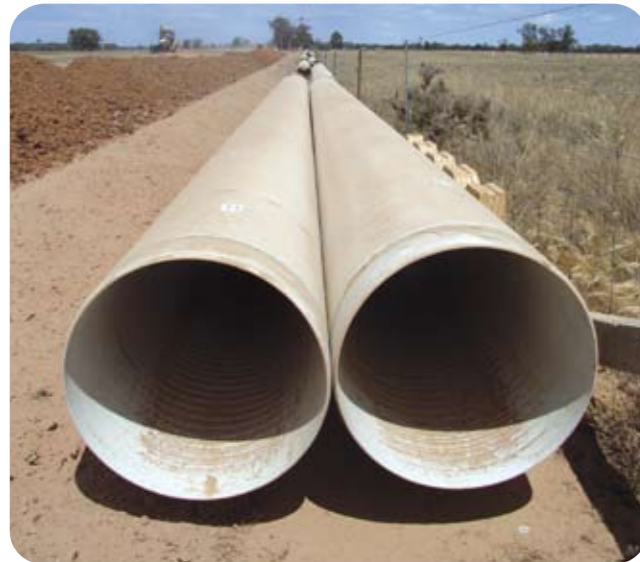
Photo: Glass reinforced plastic pipe being laid south of Donald

To view a copy of our 'Water Carting' fact sheets, visit www.gwmwater.org.au or phone our Customer Contact Centre on 1300 659 961.